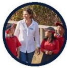
Build skills through fun