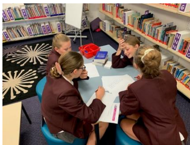
Working hard preparing debate

On Wednesday the 14th and Monday the 19th, 4 students from the debating team participated in the Premiers Debating Challenge. In this competition the students find out the debate topic on the day and are only given 1 hour to prepare, with no assistance. The first debate was against Harrington Public School, which the TWPS team won. The second debate was against Lake Cathie, which TWPS also won. The third debate was against North Haven Public School, which TWPS ALSO won. The final debate against Laurieton Public School was the decider to move onto the regional level of the competition and the girls were very nervous during the preparation of this debate, but they worked so incredibly well under pressure and won the final debate for the day. This means that the TWPS Debating Team are the champions in this region. We look forward to moving on to the next level and the further debates. Well done team, you did a fantastic job!