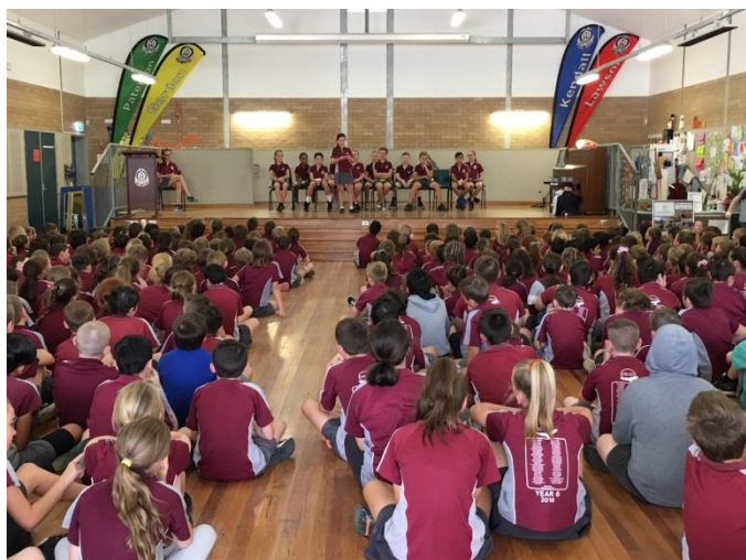
2019 School Leader Speeches