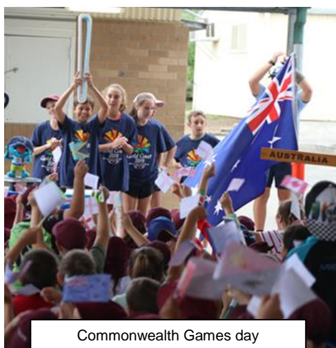
Commonwealth Games day