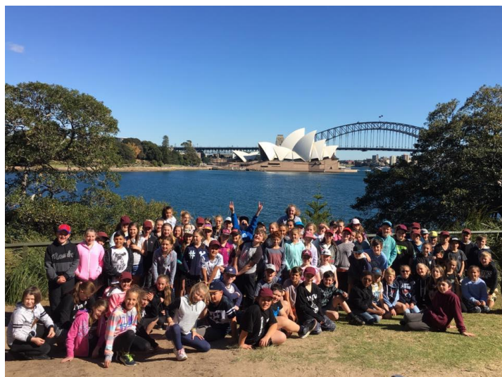
Stage 3 Sydney Excursion