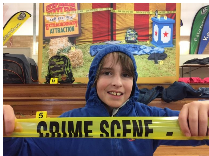
Shay 3-4S – Taping off the 'crime scene' during the Forensics Workshop