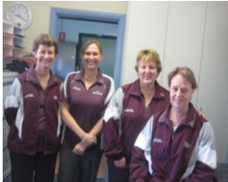
School Learning Support Officers

TWPS students and teachers are participating in a range of activities to celebrate National Literacy and Numeracy Week 2012 (27th August – 31st August). An invitation will be sent home later this week outlining in more detail the events and times for parents and community members to attend.