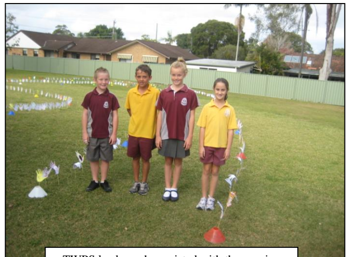
TWPS leaders who assisted with the running of the day

The focus of the week was to continue building strong, trusting and respectful relationships between Aboriginal and Torres Strait Islander peoples and other Australians.